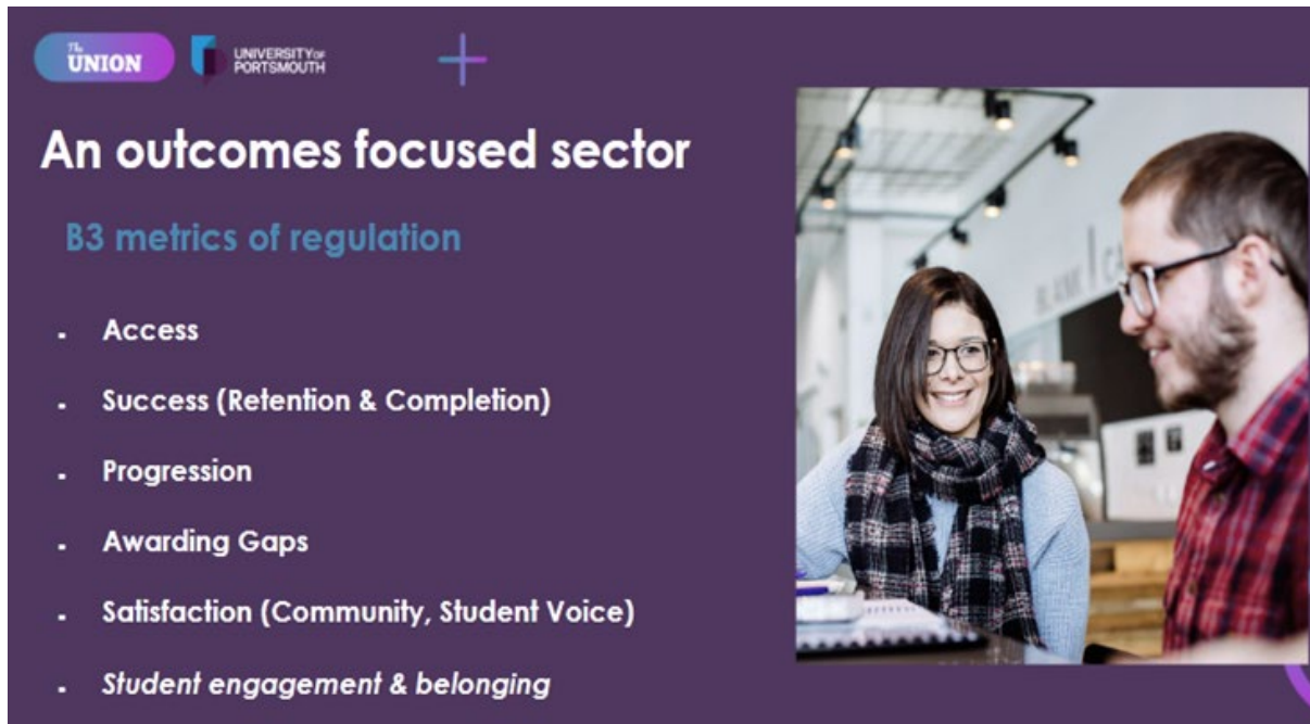
Figure 1 Metrics of regulation that drive learner development across the sector

The presenters explained how a user-focused design approach (See Figure 2) was used to standardise initiative-design and project management, in order to target support where it was most needed. This is an apt methodology to apply, which actively involves users at every stage of the design process, and applications of user-centred design can be seen across the sector with institutional examples at Nottingham Trent University and the University of Leeds. Applied to higher education this is the means to scale up improvement initiatives and ensure they are appropriately targeted. In some ways this can be seen as a means to project manage and deliver improvement at scale at a large university (See Figure 3 for update of initiatives in the pipeline).