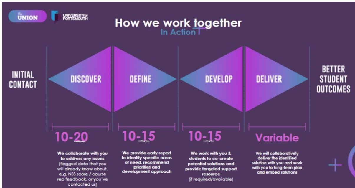
Figure 2 Design Process applied to improving Student Outcomes